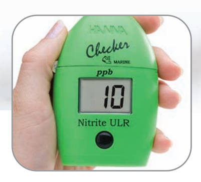
Press the button and read the results. it's that easy!