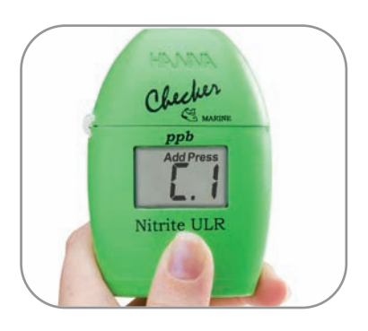
"Zero" the Checker®HC with your unreacted water sample