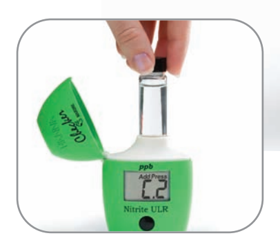
Place the cuvette into your Checker®HC