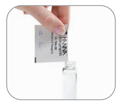
Add reagent to your water sample